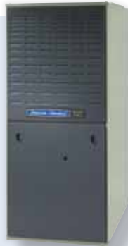
Platinum SV Freedom® 80 Comfort-R™ Variable-Speed, Communicating

It's called the Platinum Series for a reason. With AccuLink™ capability, continuous Comfort-R™ mode and an array of other innovative features, this Series gives your home both a high level of comfort and a high level of efficiency.