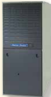
Gold SM Freedom® 80 Two-Stage