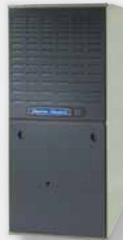
Silver XI Freedom® 80 High Efficiency Single-Stage

High end comfort, efficiency and durability, all at a value. The Silver Series provides your home with just that. Plus, every model in this series comes with the American Standard commitment to quality you expect.