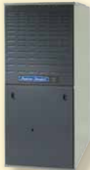
Gold SV Freedom® 80 Comfort-R™

High quality craftsmanship and durability are the trademarks of the Gold Series. With a variety of efficient models for every need, you and your home can be sure to receive both energy savings and optimal comfort.