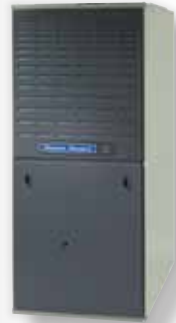
Silver SI+ Freedom® 80 Single-Stage