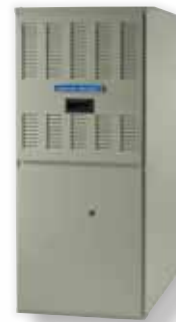
Silver SI American Standard 80